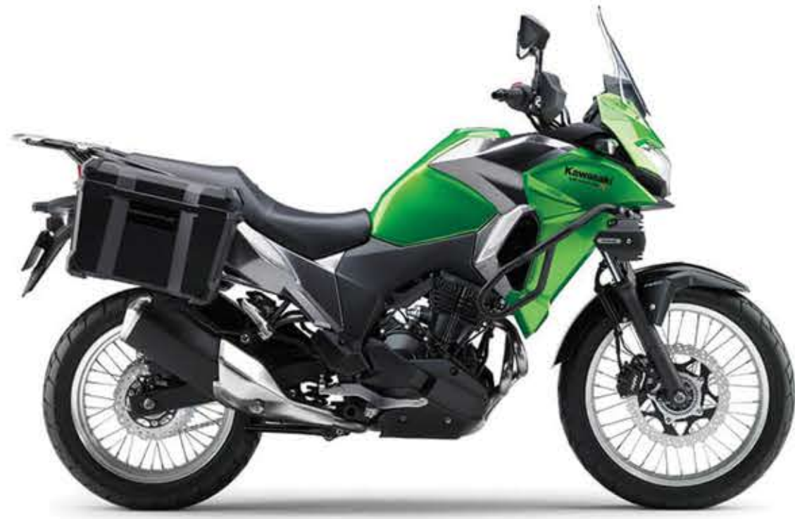
Candy Lime Green / Metallic Graphite Gray